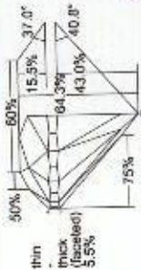
Profile to actual proportions